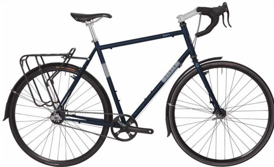
New for 2011: Civia Kingfield commuter