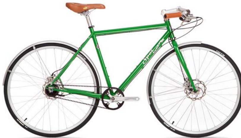
New for 2011: Spot Sprawl 8-speed urban commuter.