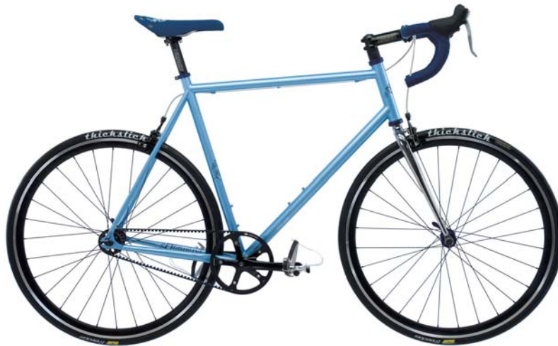
New for 2011: Norco Diamond singlespeed

The number of bike models equipped with the Gates Carbon Drive™ is expected to double to at least 90 in model year 2011, highlighting a quiet trend in the bike industry. The growing popularity of Carbon Drive is due to the fact it makes bicycling easier and more practical for a wider range of consumers. “The advantages of the Carbon Drive System are instantly obvious when you ride it,” says Todd Selden, Global Director of Gates Carbon Drive Systems. “You never have to lube it or get grease on your hands. Just get on it and ride.”