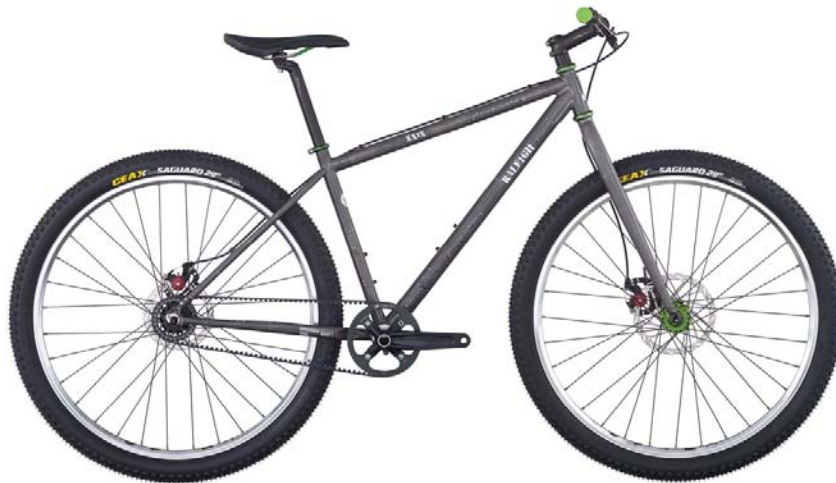
New for 2011: Raleigh XXIX singlespeed mountain bike.